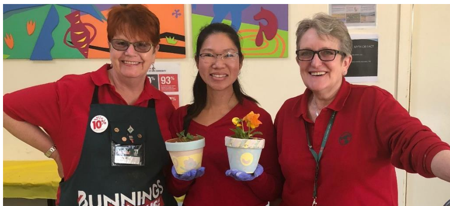
R U Ok? Day 2018

* Individuals are ACFE funded if they hold Australian citizenship, New Zealand citizenship or an Australian permanent visa.